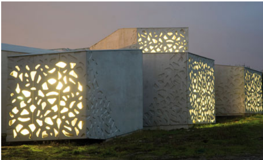
The LAM modern art museum near Lille